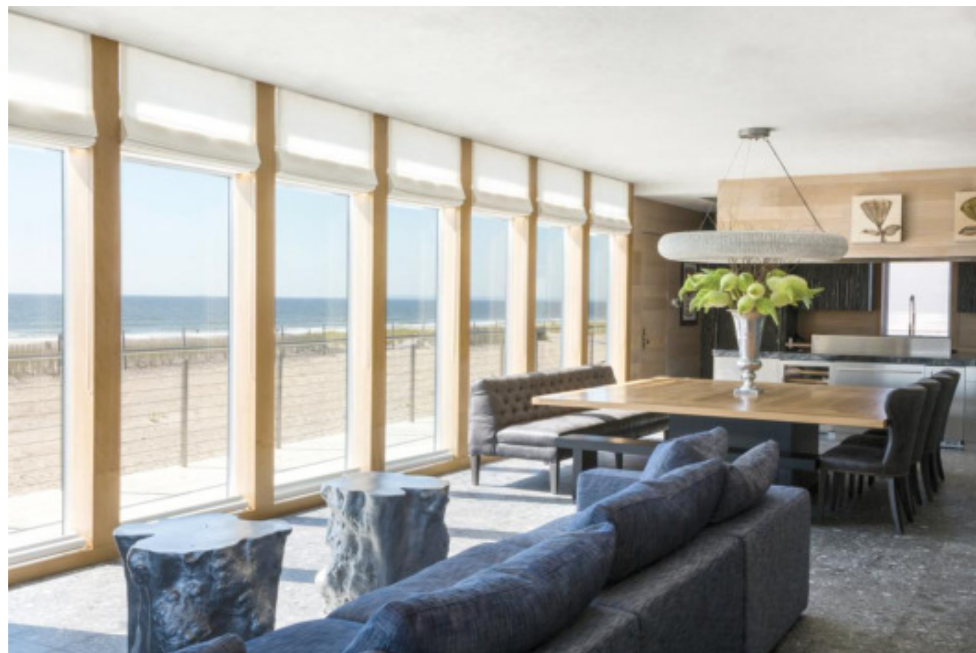
Modern yet cozy furniture invites guests to relax and let the beachside views take center stage.

Sandy made many people embrace building better at the beach. The home has a solid concrete deep foundation with upper floors constructed of structural steel, light gauge steel and concrete floor slabs. This method allows for window bracing to mitigate the building flex that occurs in hurricane winds. The windows are impact windows to prevent damage during a storm, and the home has a full sprinkler system to prevent fire.