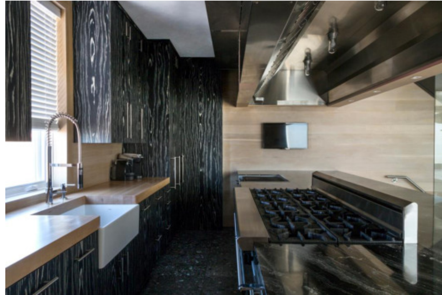
The galley-style kitchen features a large indoor grill, 10-burner stove, ovens, refrigerator drawers, warming drawers, beverage drawers and lots of workspace, all with a commercial grade exhaust hood above.

It was achieved by pairing the natural woods, stone and plaster work. The floor is honed marble to eliminate sun reflection with radiant heat to warm feet. The walls are in a weathered blond oak to contrast the dark exterior, while the fireplace is a polished black marble. The ceiling complements these contrasts with a finely textured plaster.