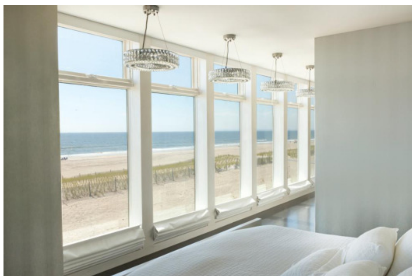
The goal of the home was to bring in as much natural light into the space as possible.

We removed the interior walls to entirely open the first-floor plan. The stairway was treated as a secondary smaller element—as opposed to a celebrated design element—freeing up additional space.