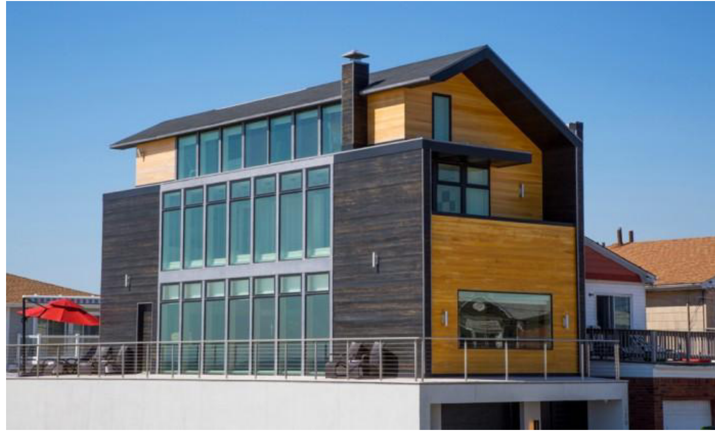
The beachside abode is made for entertaining, with an open-plan first-floor living space, a master suite on the second floor and attic bedrooms for guests staying over.